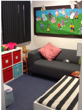
Ty Twt role pay area